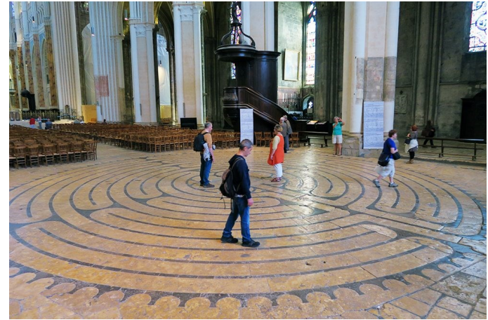
Labyrinth at Chartres Cathedral, Chartres, France